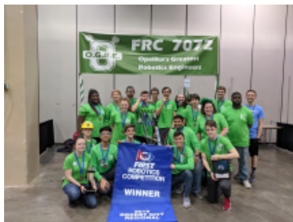
2019 Rocket City Regionals Winners